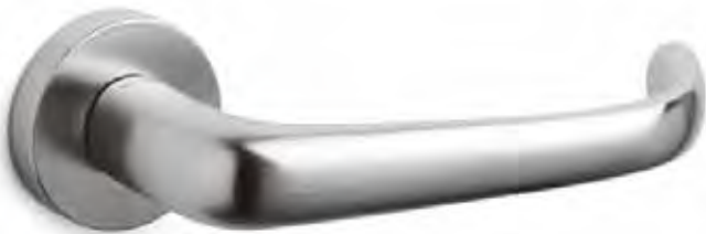
Clinica 140 - M114