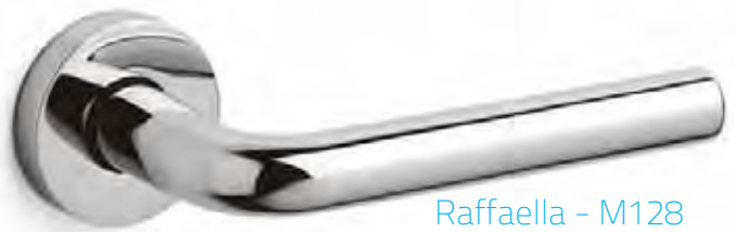
Raffaella - M128