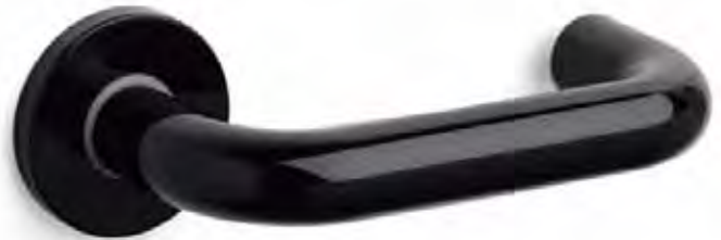
Chiara Nylon - M509