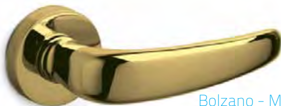
Bolzano - M103