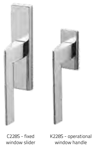
C228S - fixed window slider