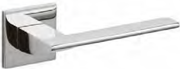
Trend - M228