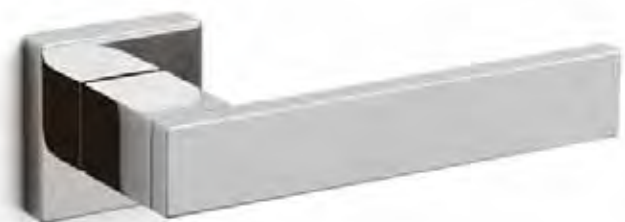
Diana - M206