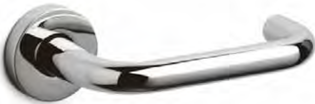
Chiara - M125