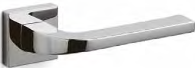
Lesmo - M211