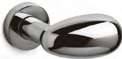
Uovo - M108