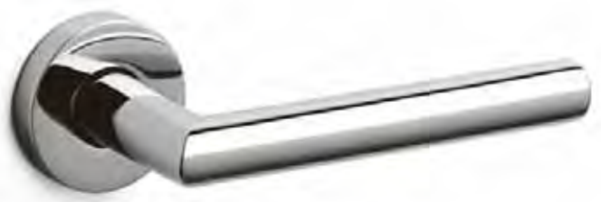
Serenella - M130