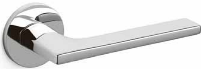
Lotus - M238R