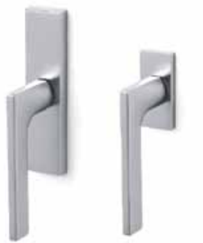
C238S - fixed window slider