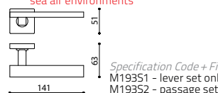
Specification Code + Finish M19351 - lever set only M19352 - passage set incl. latch

IS superinox satin - guaranteed not to pitt or tarnish for 30 years in sea air environments