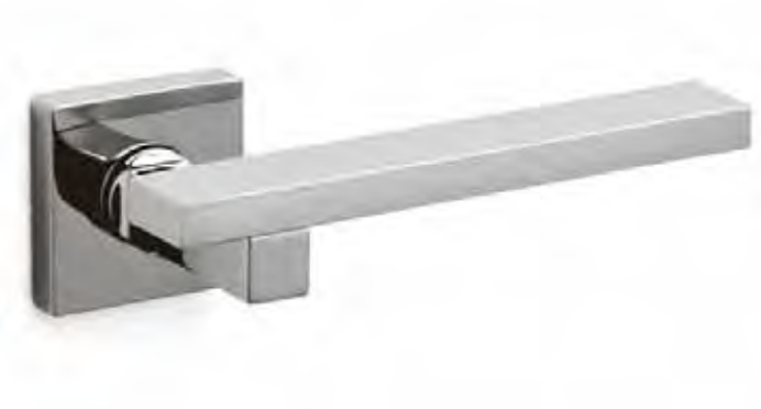
Aurora - M164