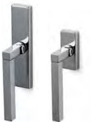
C1935 - fixed window slider