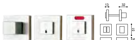
Cubo - Studio Olivari Specification Code + Finish H136S - snib only H136V6 - privacy snib & eRelease H136F6 - indicating snib & eRelease