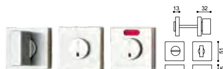
Space Q - Studio Olivari Specification Code + Finish H202S - snib only H202V6 - privacy snib & eRelease H202F6 - indicating snib & eRelease