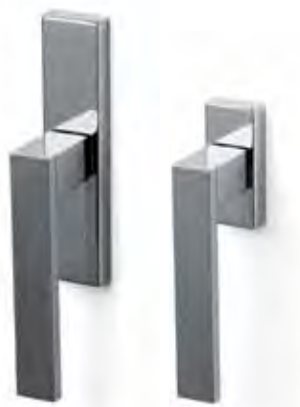
C207S - fixed window slider