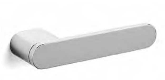
Radial - M235