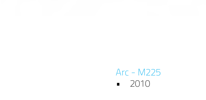
Arc - M225