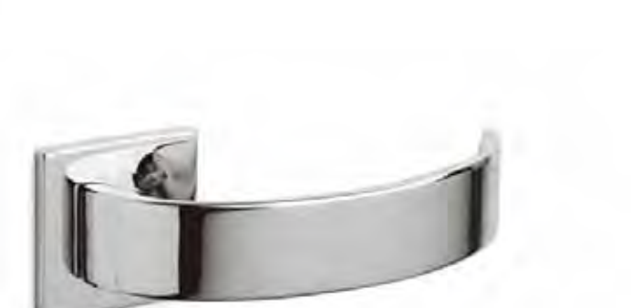
Total - M207