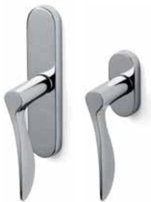
C116R - fixed window slider