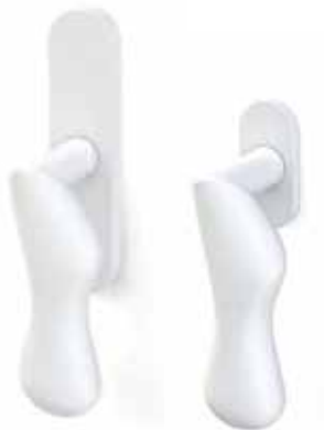
C232R - fixed window slider