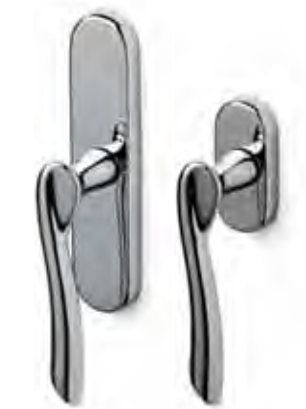
C173R - fixed window slider