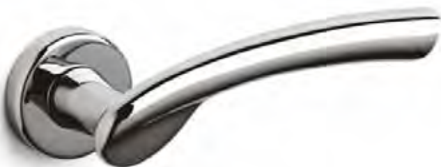
Nirvana - M