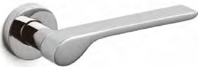
Ala - M215