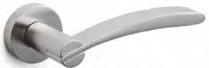
Selene - M194