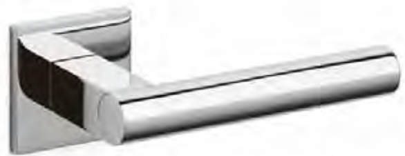
Euclide & Euclide Q - M229