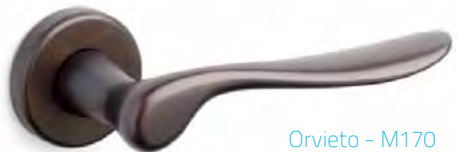
Orvieto - M170