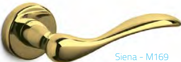
Siena - M169