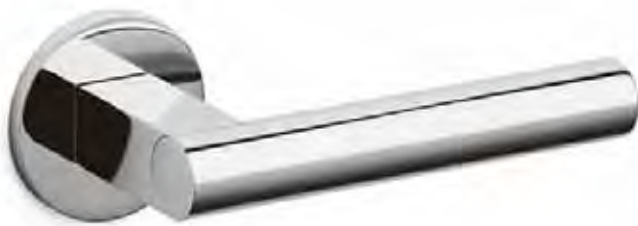
Novella - M165