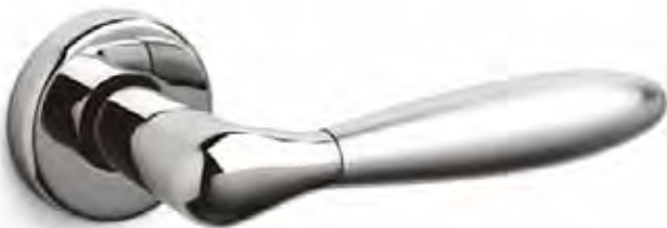
Comet - M183