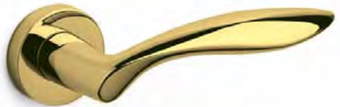
Onda - M175