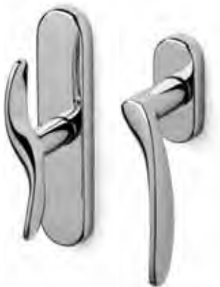
C165R - fixed window slider