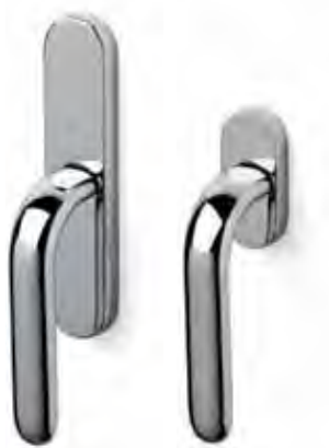
C152R - fixed window slider