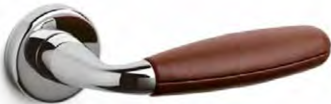
Club - M181