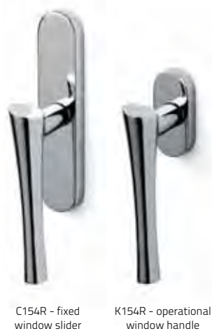
C154R - fixed window slider