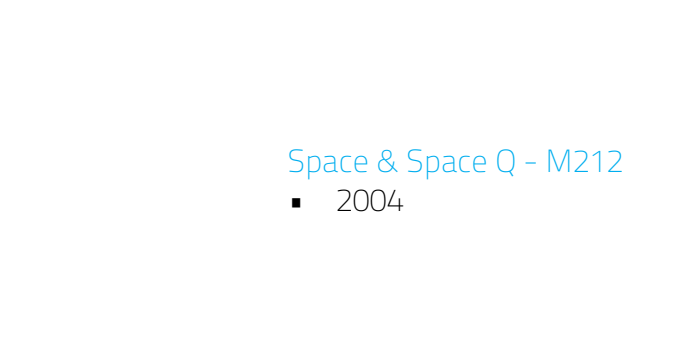
Space & Space Q - M212