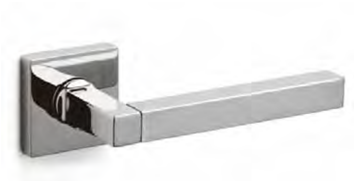
Time & Time Q - M192