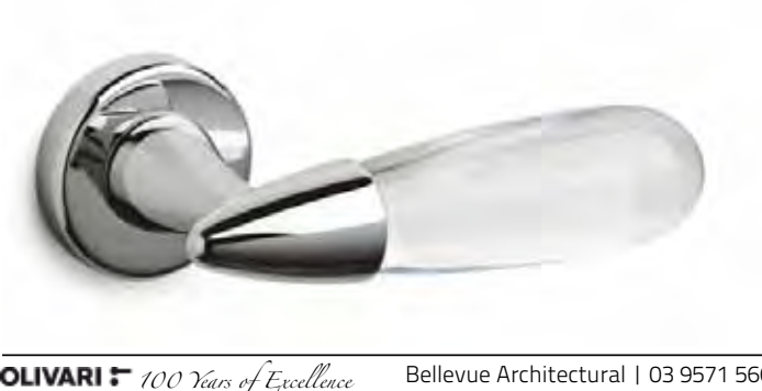
Aurora - M164