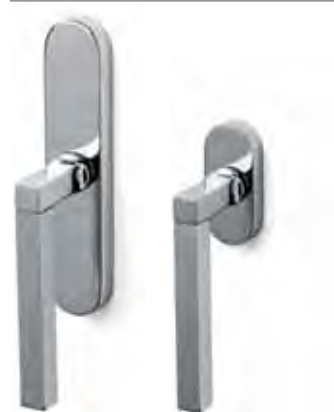
C193R - fixed window slider