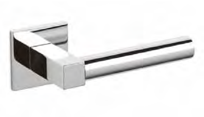
Pittagora Q - M239S