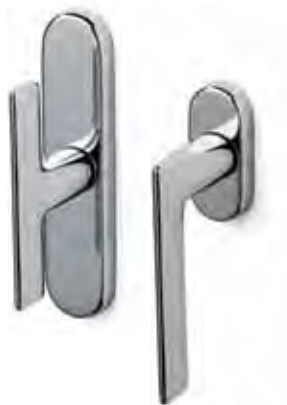
C182R - fixed window slider