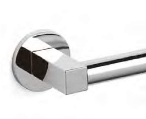
Pittagora - M239R