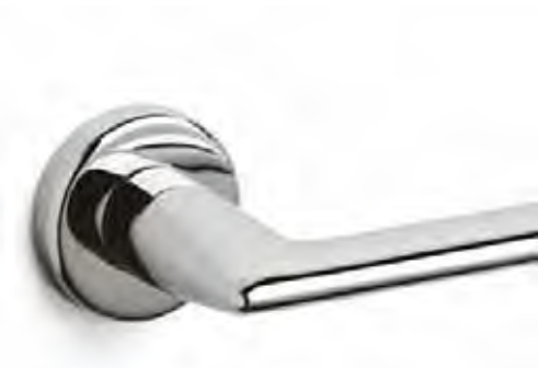
Tecno - M182