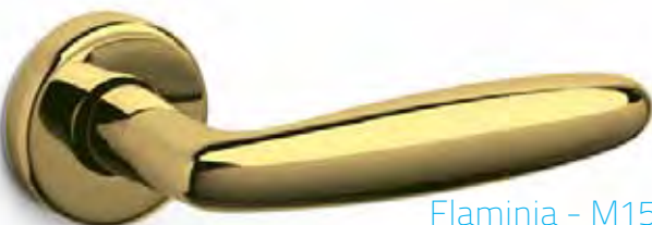
Flaminia - M159