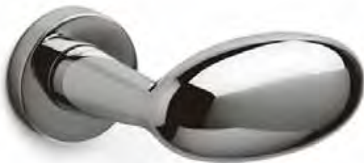
Blindo - M178