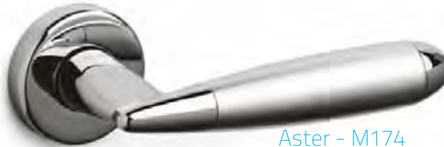
Aster - M174