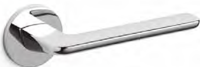
Marbella - M237