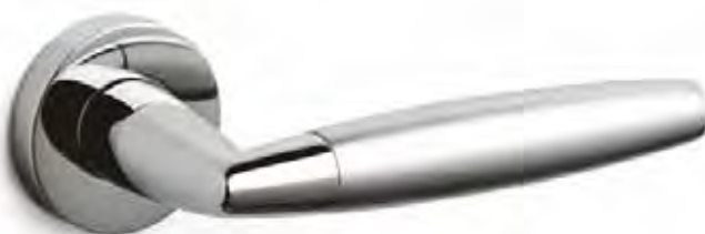
Sector - M186