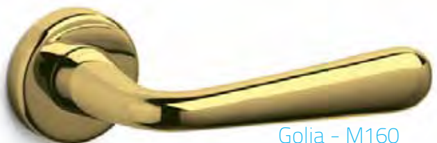
Golia - M160