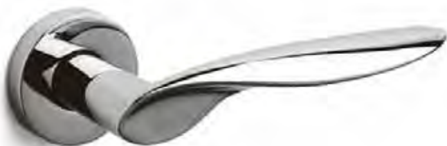
Wind - M187