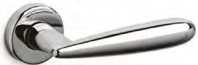
Futura - M172