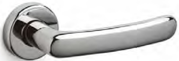
Emilia - M167