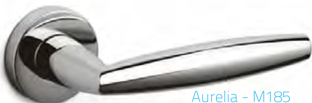
Aurelia - M185