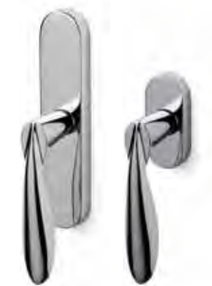
C187R - fixed window slider