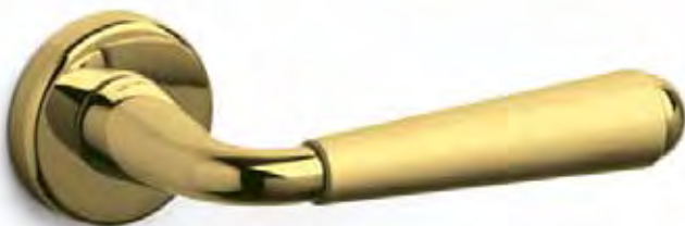
Gardena - M166