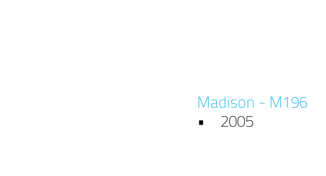
Madison - M196