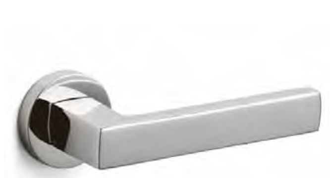
Planet - M195R