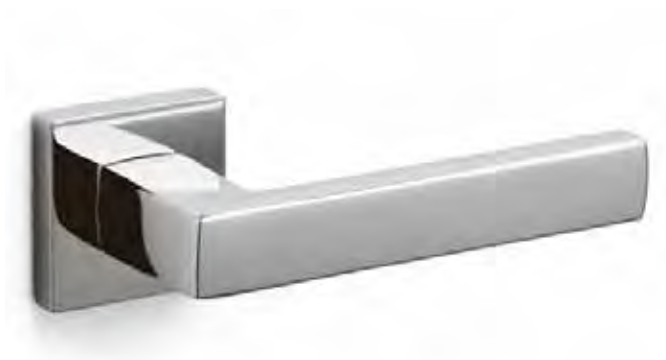
Planet Q - M195S