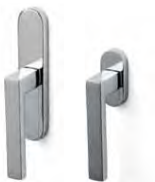
C195R - fixed window slider