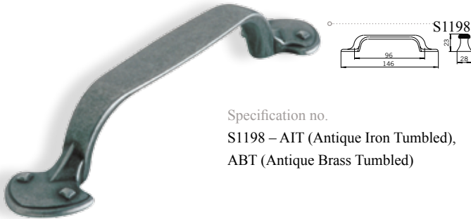
Specification no. S1198 – AIT (Antique Iron Tumbled), ABT (Antique Brass Tumbled)