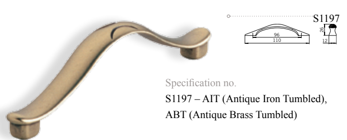
Specification no. S1197 – AIT (Antique Iron Tumbled), ABT (Antique Brass Tumbled)