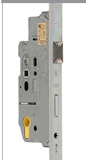
Latch & Dead Bolt