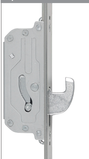
Top & Bottom Hook Bolt