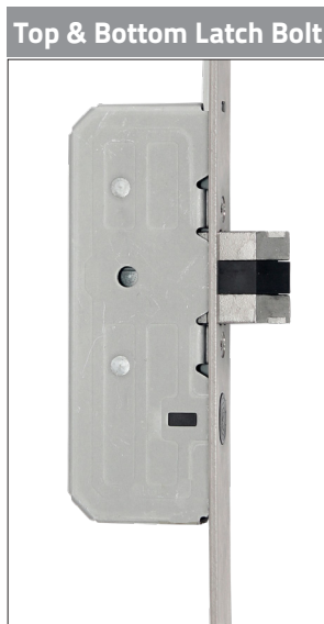
Top & Bottom Latch Bolt