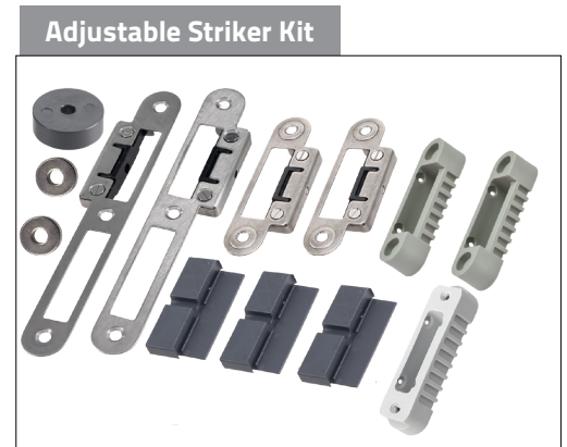
Adjustable Striker Kit

An Ideal Electronic Lock that Self Locks & Unlocks including Internal Escape Mode Functionality