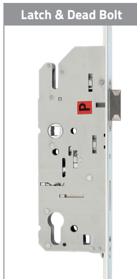
Latch & Dead Bolt

3 separate points of locking on a door is always going to be stronger than one.